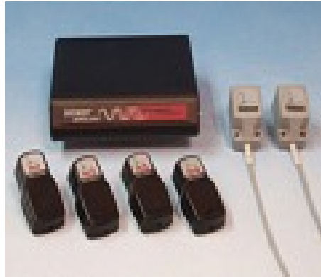
Fig. 3. Patriot wireless electromagnetic tracker