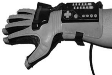
Fig. 5. An instrumented glove (Nintendo power glove)

Dataglove is a neoprene fabric glove with two fiber optic loops on each finger. Each loop is dedicated to one knuckle and this can be a problem. If a user has extra large or small hands, the loops will not correspond very well to the actual knuckle position and the user will not be able to produce very accurate gestures. At one end of each loop is an LED and at the other end is a photosensor. The fiber optic cable has small cuts along its length. When the user bends a finger, light escapes from the fiber optic cable through these cuts. The amount of light reaching the photosensor is measured and converted into a measure of how much the finger is bent (Aukstakalnis & Blatner, 1992). Dataglove requires recalibration for each user (Hsu, 1993). Fatigue effects and recalibration during a session are problems associated with long term use of Dataglove (Wilson & Conway, 1991).