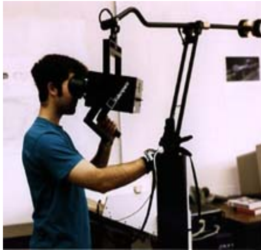
Fig. 2. A binocular omni-orientation monitor (BOOM)