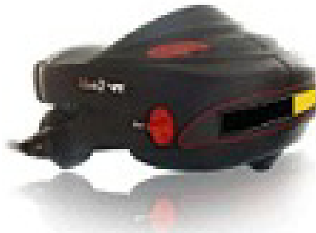
Fig. 1. Visette 45 SXGA head mounted display (HMD)

Small CRT head mounted display uses two CRTs that are positioned on the side of the HMD. Mirrors are used to direct the scene to the viewers' eye. Unlike the projected HMD where the phosphor is illuminated by fiber optic cables, here the phosphor is illuminated by an electron gun as usual (Lane, 1993). CRT head mounted display is in many ways similar to the projected HMD. This type of HMD is heavier than most other types because of added electronic components (which also generate large amounts of heat). The user wearing this type of HMD may feel discomfort due to the heat and the weight of the HMD (Bolas, 1994).