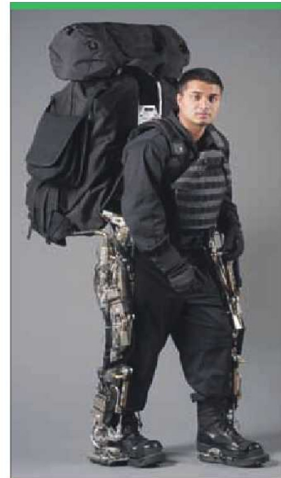
The University of California's Berkeley Department of Mechanical Engineering has developed the Bleex (Berkeley Lower Extremity Exoskeleton) machine which was the result of Darpa funding.

Berkeley's mechanical engineers. Other initiatives have included the Exohiker, the 2005 prototype of which allowed the wearer to carry loads of up to 68 kg at an average speed of four km/h across a range of 67 km using lithium polymer batteries. The Exohiker is joined by the Exoclimber, which enables the wearer to carry a similar load while ascending heights up to 183 metres. The Exoclimber was evaluated by US Army Rangers in October 2005 at the Flat Irons Mountain Range in Boulder, Colorado, where it