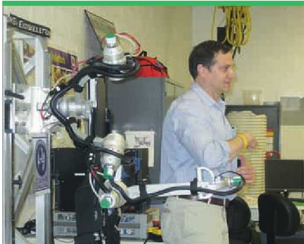
Several exoskeleton projects are ongoing in the academic and civilian worlds, which could develop technology that could be spun out into military applications, such as this University of Maryland's Exoskeleton Rehabilitation System.

could wear with a power pack to provide them with extra strength on demand without needing to wear a bulky exoskeleton.