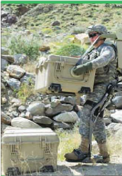
Lockheed Martin's Lift Assist Device has been developed to complement the company's Hulc. It connects to the Hulc and allows the user to lift and carry heavy loads. (Lockheed Martin)

which can flow back into the battery. The Hulc detects its passenger's movements with footpad-mounted sensors that send information regarding the movement's characteristics, such as direction, to a computer, which will then direct the Hulc's hydraulic system to assist that particular movement. Thanks to its hydraulic design, the wearer can comfortably move over the roughest terrain carrying a heavy load.