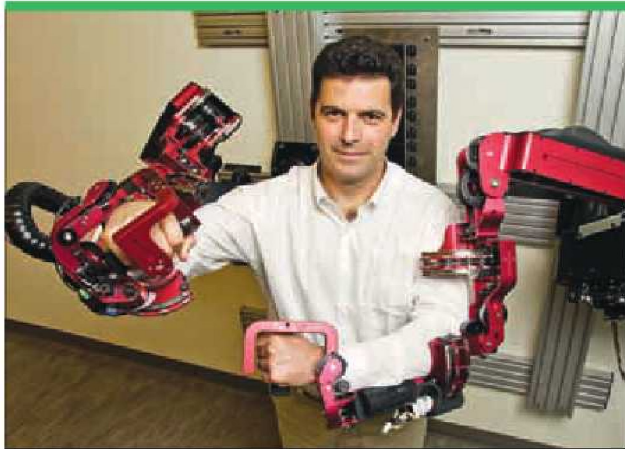
Several academic institutions are performing important research into powered exoskeletons. One such project is being pursued by the University of California's Baskin School of Engineering, which has developed a set of prototype exoskeleton arms.