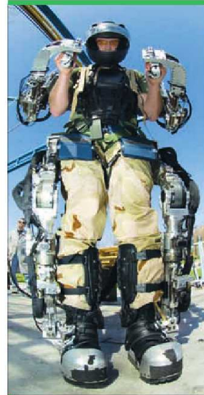
Raytheon's purchase of Utah-based Sarcos has given the company a portfolio of exoskeleton expertise. The firm's Xos is expected to be developed as a prototype suit for the US military to assist logistical tasks.