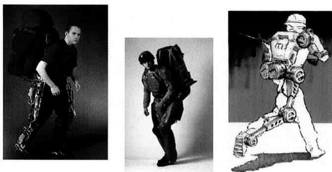
Exoskeleton system images.

In 2001 the Infantry Operational Advisory Group recommended key weights during different times of movement toward the enemy. Those weights were as follows: